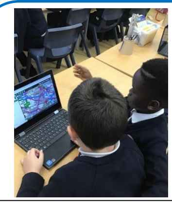
Year 2 loved exploring using Digimaps in Geography.