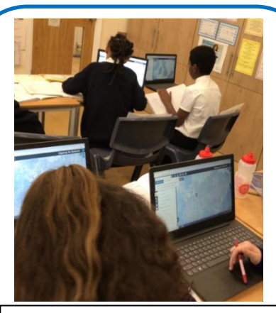
Year 5 loved learning about longitude and latitude using digimaps.