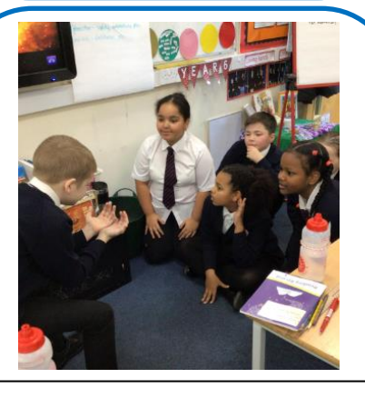
Year 6 loved creating freeze frames in literacy.