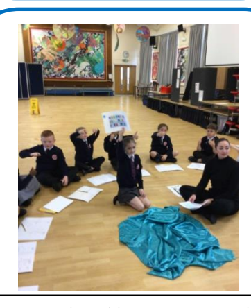
Year 4 loved learning about the achievements and influence of the ancient Greeks.