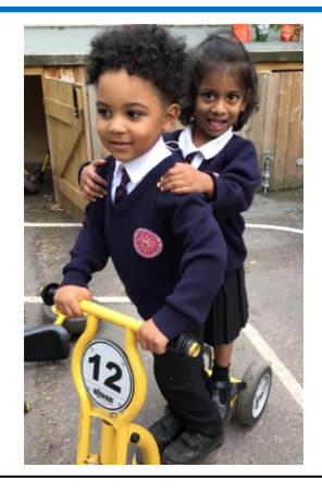
Early Years loved practicing their balancing and sharing skills.

The children and teachers are very proud of the learning that has been happening within school this week. To see more pictures, visit our Facebook, Twitter and Instagram pages.