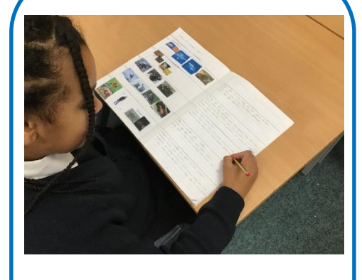
Year 4 have been learning to group vertebrates and invertebrates by identifying key characteristics.