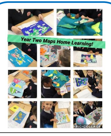
Year 2 loved showing off their amazing geography home learning and using it in their lesson!