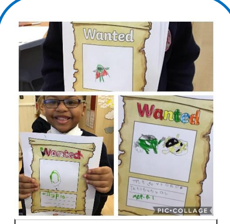
Reception have made wanted posters for the evil pea in the book 'Supertato: Evil Pea Rules.