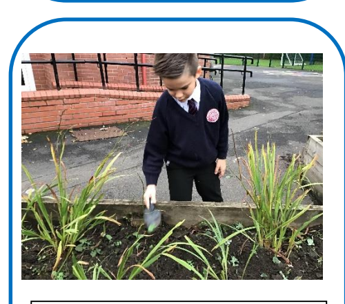
Year 3 loved tidying up our garden area whilst learning about roots!