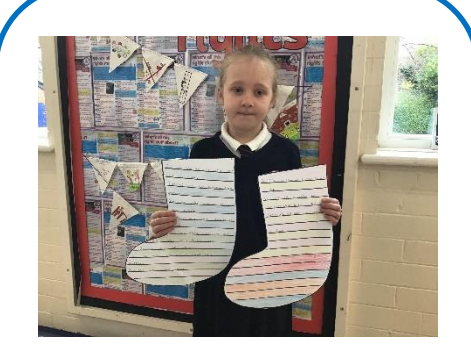
Year 4 enjoyed writing poems as part of Anti-Bullying week. They used similes to describe a bully and what a good person is like.