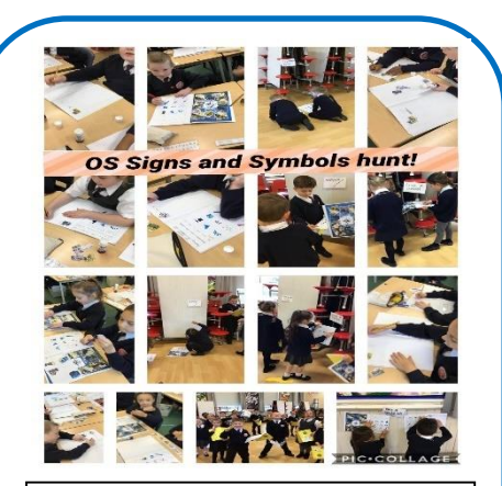
Year 2 had an exciting Thursday afternoon in geography exploring OS signs and symbols.