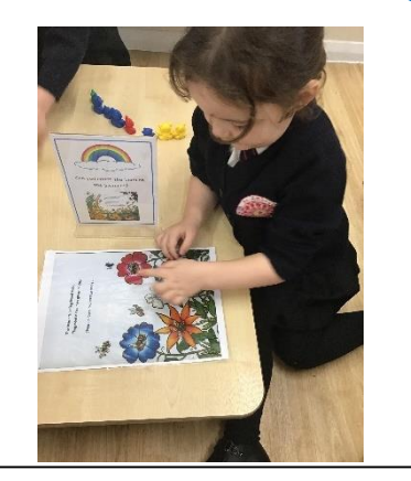
Our Nursery children have completed their first maths challenge this week! Our counting skills are really improving!

The children and teachers are very proud of the learning that has been happening within school this week.