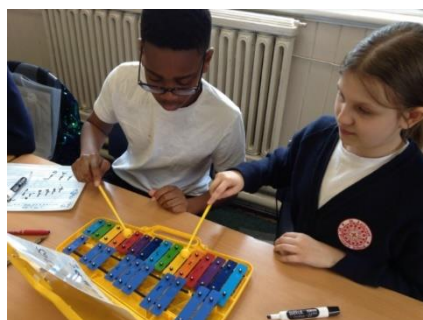
Year 6 exploring the minor scale in music.