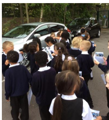
Year 1 loved researching how cars have changed over time.