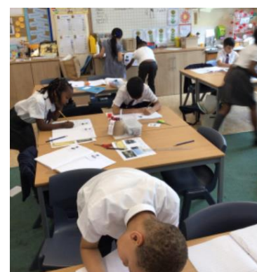
Y2 loved finding facts about Sir John Alcock and Sir Arthur Whitten Brown.