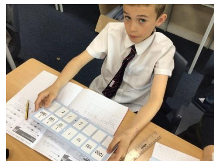
Year 5 loved using place value whiteboards to help them divide and multiply decimals.