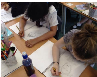
Year 4 also loved sketching ideas for their art jubilee collages.