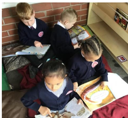
Early Years loved reading in their new outdoor reading area.

It has been another wonderful week at St. Ambrose and we are proud of the children and their learning. You can see more pictures of their learning on our social media pages.