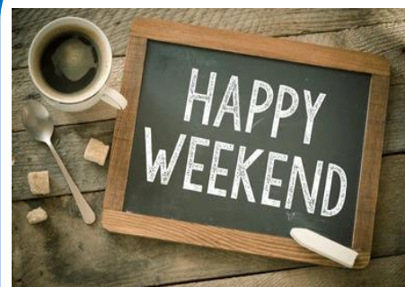
Have a lovely weekend.