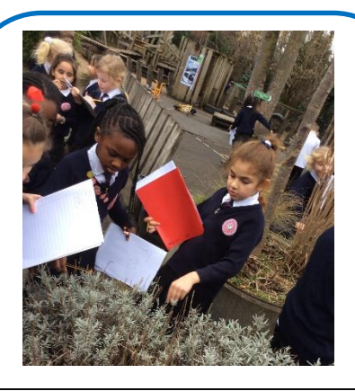
Year 1 loved being plant detectives around the school in Science.