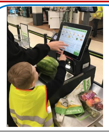
Early Years loved buying fruit and vegetables on their trip.

In another wonderful week at St. Ambrose, the children have loved their learning. We are very proud of the children and their learning and you can see more pictures on our social media pages.