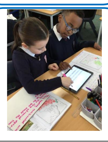
Year 4 loved learning about the Roman army in History.