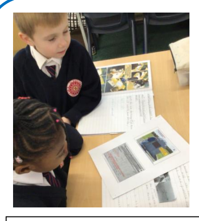
Year 2 loved exploring the achievements of the Wright brothers.