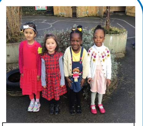
Early Years loved dressing to express and shared what makes them feel happy.

It has been a special week at St. Ambrose as we have celebrated Safer Internet Day and Mental Health Awareness week. We are proud of the children and their learning and you can see more pictures of their learning on our socail media pages.