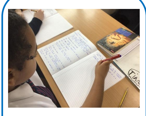
Year 5 loved writing a recipe for how to be respectful online.