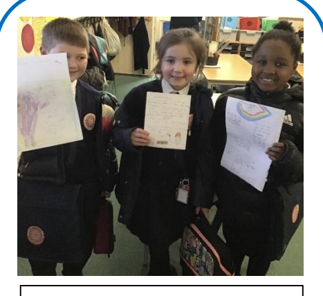
Year 3 loved learning about what response to use to keep safe online