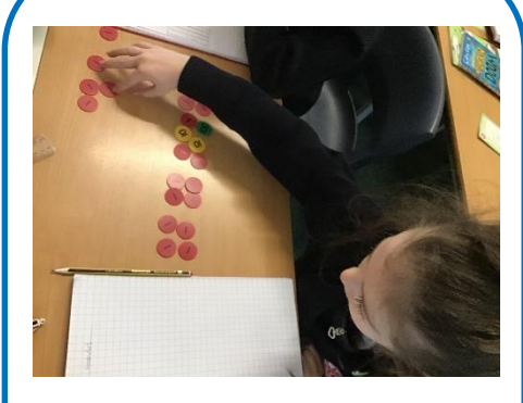
Year 3 loved using counters to practice sharing equally in maths.