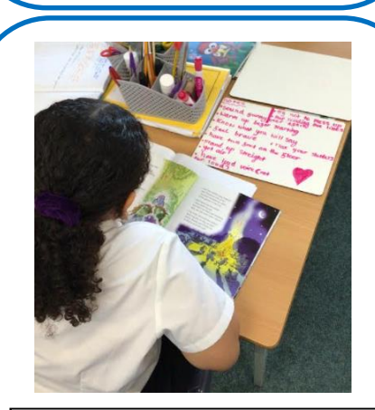
Year 4 loved reciting verses to perform for a class poem.