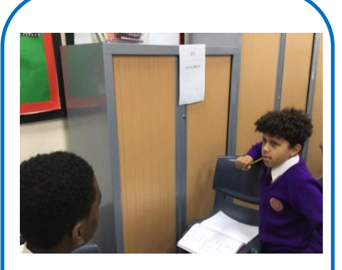
Year 5 loved doing a maths hunt whilst practicing division.