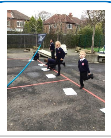
Year 2 loved testing out predictions about what would make their heart beat faster