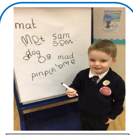
Early Years loved practicing their handwriting.

It has been another wonderful week at St. Ambrose and we are proud of the children and their learning. You can see more pictures of their learning on our socail media pages.