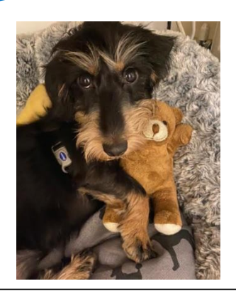
It's always lovely to cuddle something that you like that makes you feel good.