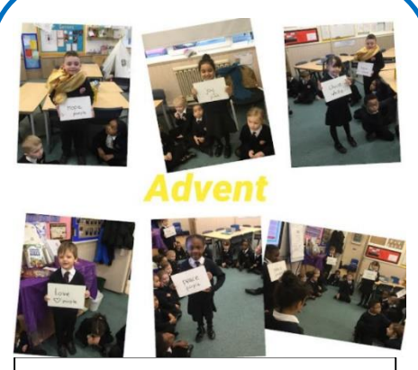
Year 1 loved acting out the advent wreath to remember what each candle symbolises.