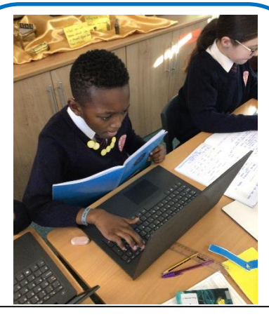
Year 4 loved typing up their poems to experiment with their form.