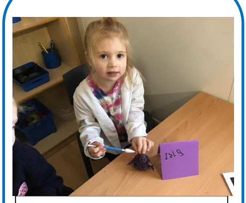
Early years have loved making their own owls from our story 'Owl Babies.

The children and teachers are very proud of the learning that has been happening within school this week. To see more pictures, visit our Facebook, Twitter and Instagram pages.