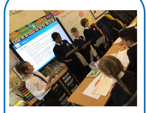
Year 4 loved presenting their persuasive pitch to investors in a new gadget.