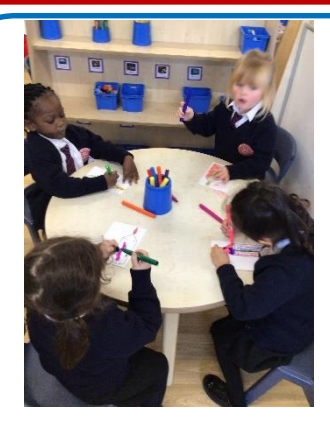
Early Years loved learning about the baptismal candle.

The children and teachers are very proud of the learning that has been happening within school this week. To see more pictures, visit our Facebook, Twitter and Instagram pages.