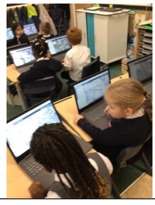
Year 2 loved exploring the local school area on digimaps in Geography.