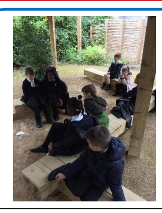
Year 2 loved meditating over God's wonderful creations.