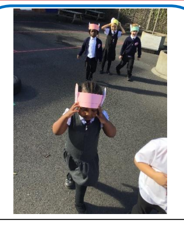
Early Years loved identifying different environmental sounds.

The children and teachers are very proud of the learning that has been happening within school this week. To see more pictures, visit our Facebook, Twitter and Instagram pages.