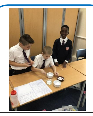
Year 5 loved following a set of instructions to make homemade sherbert.