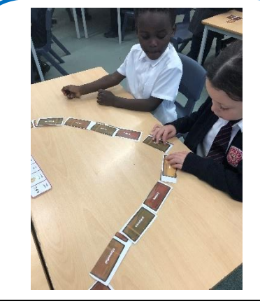
Year 1 loved learning about families and choosing words associated with our families.