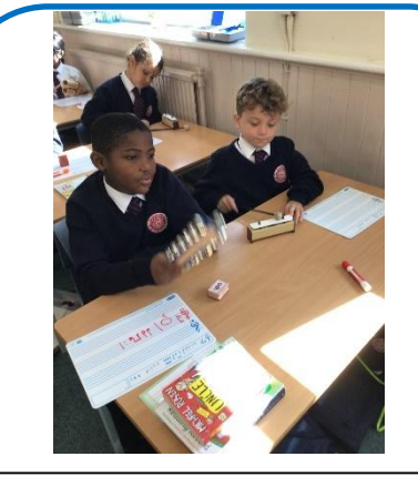
Year 4 loved using a variety of instruments to play music that they composed,