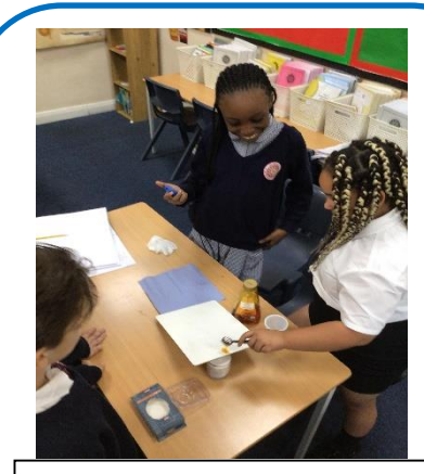
Year 5 loved investigating the viscosity of different liquids in science.