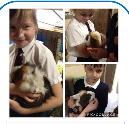
Year 3 loved looking after the guinnea pigs this week and learning how to care for them.

Year 2 loved exploring tone and texture using different mediums in art.