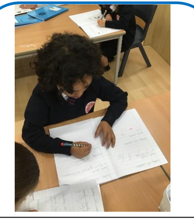
Early Years loved writing their new sounds in Read Write Inc.

The children and teachers are very proud of the learning that has been happening within school this week. To see more pictures, visit our Facebook, Twitter and Instagram pages.