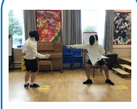
Year 6 loved learning new skills in PE this week. They love doing fencing.