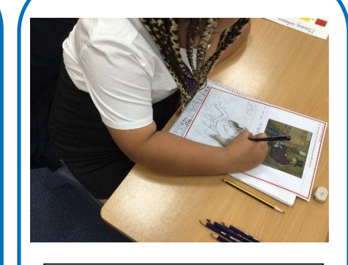
Year 5 loved drawing in the style of Henri Toulouse - Lautrec and used a cross hatching technique for shading.