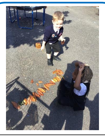
Early Years loved counting different objects using the 1:1 principle.

The children and teachers are very proud of the learning that has been happening within school this week. To see more pictures, visit our Facebook, Twitter and Instagram pages.