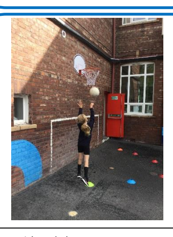
Year 4 loved shooting into a target in PE this week,