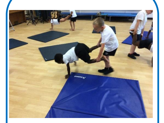
Year 1 loved learning in pairs in PE. They helped each other to balance and put weight on their hands.