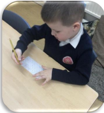
Year 1 have loved counting in twos this week.