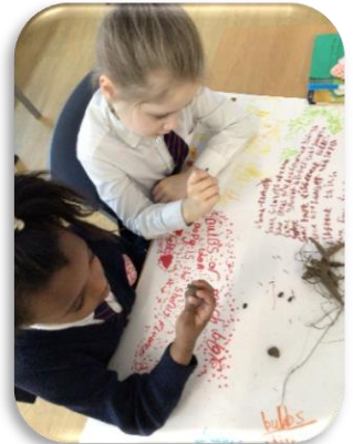
Year 2 have loved exploring, sorting and classifying seeds and bulbs this week.