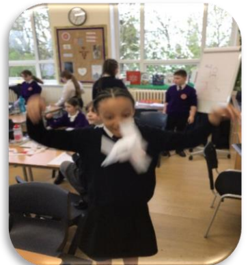
Year 5 loved learning about air resistance and making paper helicopters to see its affects.