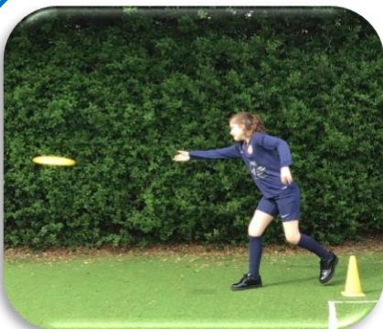
Year 6 have enjoyed learning and developing new athletic skills