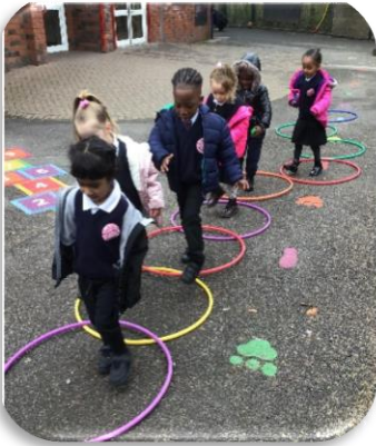
EYFS love to count outside

Summer 1 Week 1 of a great week at St. Ambrose and we are very proud of the learning that our children do.