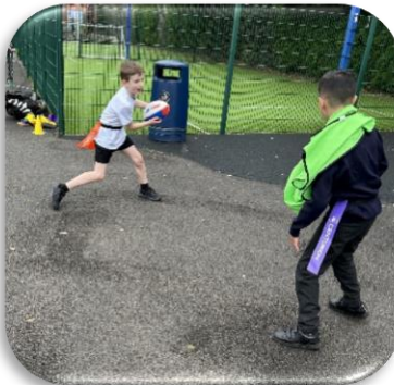
Year 4 have loved learning the skills of playing Tag rugby