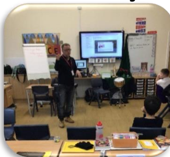
Year 1 - 6 have enjoyed a special visit from a Halle Orchestra musician.