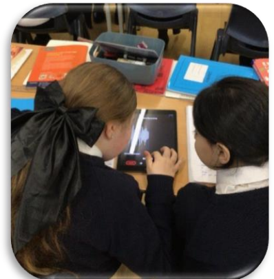
Year 5 loved creating podcasts to help them to understand the features of biographies.