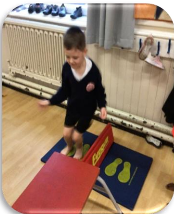
Year 3 have loved forming routines in P.E this week!