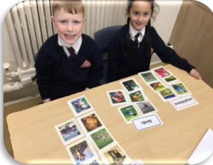
Year 1 have loved sorting animals into different groups in Science