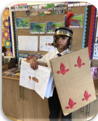
Year 4 loved learning about the Roman army and why they helped the Roman Empire expand.