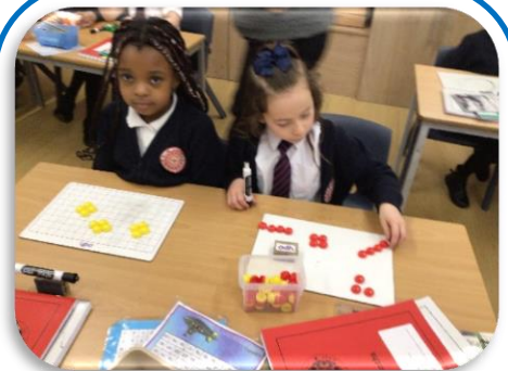
Year 2 have enjoyed recognising and finding equal groups in maths this week.