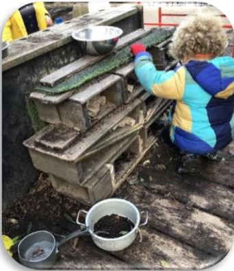
EYFS have loved making their bug hotel this week.

Spring 1 Week 4 of a great week at St. Ambrose and we are very proud of the learning that our children do.