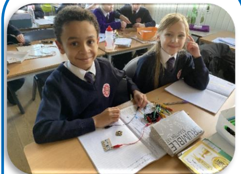
Year 5 loved programming crumble controllers.