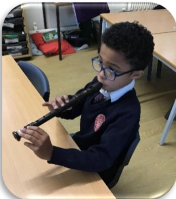
Year 3 have loved learning how to play Hot Cross Buns on the recorder this week!