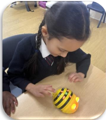
Year 1 loved exploring bee-bots commands in computing