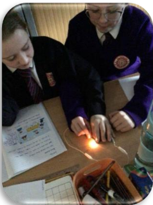
Year 6 loved creating simple circuits in science, exploring how electricity flows.