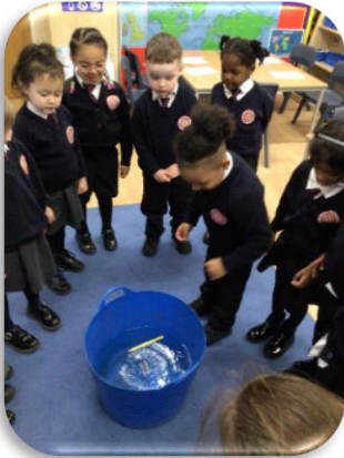
EYFS have loved exploring objects that float and sink.

Spring 1 Week 1 of a great week at St. Ambrose and we are very proud of the learning that our children do.