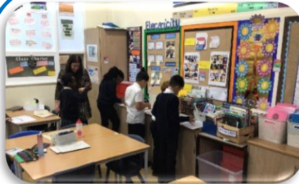
Year 4 loved doing a classroom hunt for key events in the Roman Empire to complete their timeline.