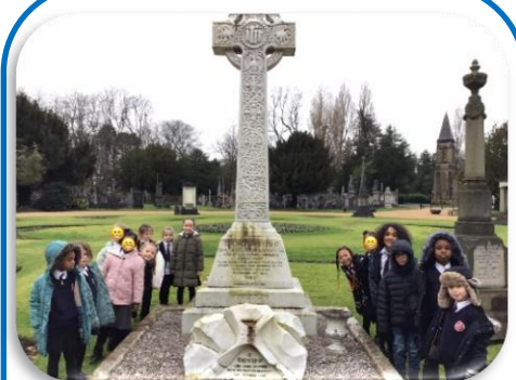
Year 2 have been to see where John Alcock and Arthur Whitten Brown lived. Alcock is buried in Southern Cemetery. They were the first to fly across the Atlantic Ocean non-stop!