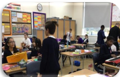
Year 6 have loved getting the instruments out in music!