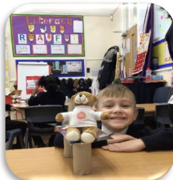
Year 2 used the joining and strengthening skills they have learnt this term to make a chair for the bear. They have been learning what makes and how to make a free-standing structure.