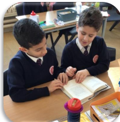
Year 5 loved researching Mother Teresa and reading her book.