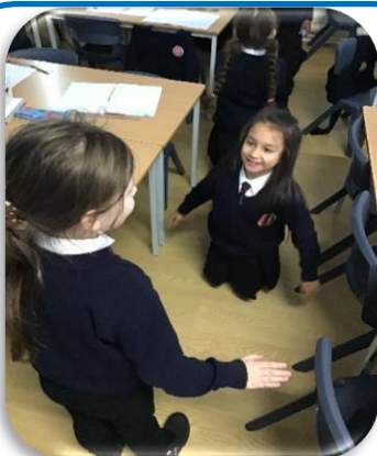
Year 3 have loved role-playing the Annunciation as Mary and the Angel Gabriel in R.E. this week!