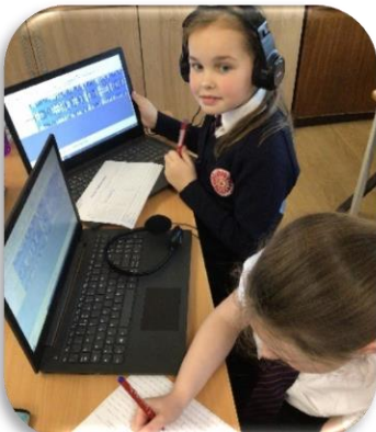
Year 4 loved evaluating their podcasts.