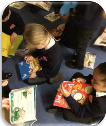
EYFS love to read Christmas stories

Autumn 2 Week 7 of a great week at St. Ambrose and we are very proud of the learning that our children do.