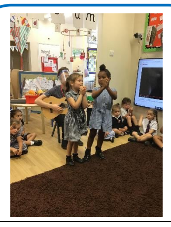
Nursery loved taking it in turns to be song leaders in music this week.

The children and teachers are very proud of the learning that has been happening within school this week. To see more pictures, visit our Facebook, Twitter and Instagram pages.