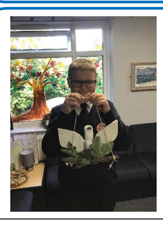
Year 5 loved ,aking sculptures in art this week.