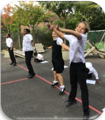
Year 6 loved testing their science predictions about the impact of exercise on heart rates