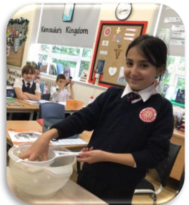
Year 5 loved making plastic to investigate irreversible changes of states.