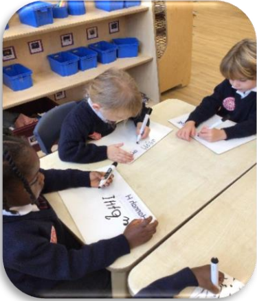
Early Years have loved practising their letter formation

Week 6 of a great week at St. Ambrose and we are very proud of the learning that our children do.