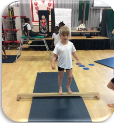
Year 1 have loved learning about performing spins