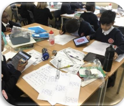
Year 4 have loved creating Persuasive leaflets about different holiday destinations.