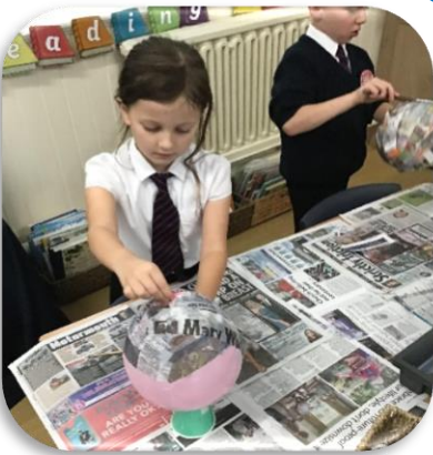
Year 3 have loved using papier maché to create Greek vases in art this week!