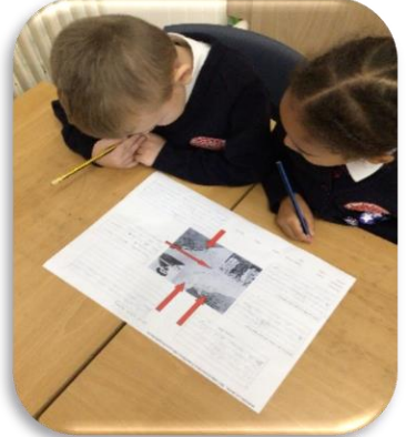
Year 2 loved learning about the history of flight. This week we learnt about the first flight across the English Channel by Louis Bleriot.