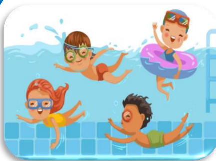
Year 4 have loved making great progress in their swimming lessons

(No photo due to swimming safeguarding reasons)