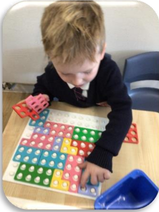
Early Years have loved exploring Numicon

Week 5 of a great week at St. Ambrose and we are very proud of the learning that our children do.