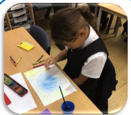
Year 2 loved creating a wax resistant painting of the school pond in art.