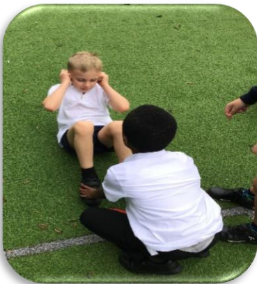
Year 3 have loved conserving and exhausting their energy levels in P.E. this week!