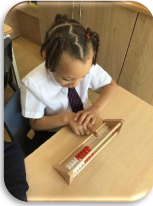
Year 1 have loved using their rekenreks to learn the different ways we can make 5