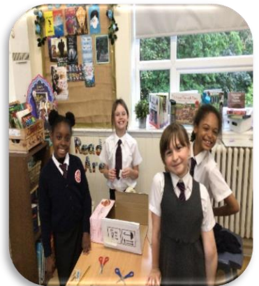
Year 5 loved starting to create their mixed-media sarcophagus'.

(No photo due to swimming safeguarding reasons)