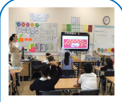
Year 6 loved their session from Kooth, helping them prepare for high school and develop their mental health.