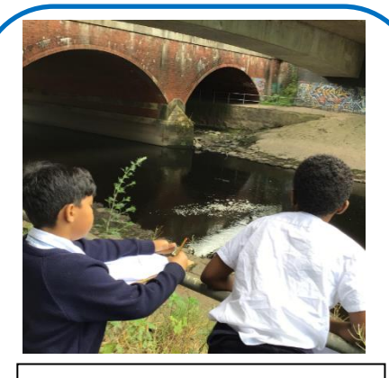
Year 5 loved carrying out fieldwork at the river Mersey and identifying features of the river