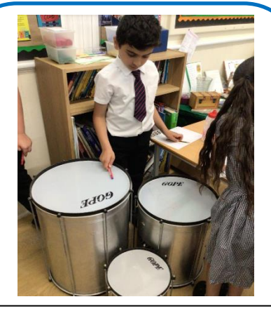
Year 4 have been investigating pitch in their science topic 'sound'.