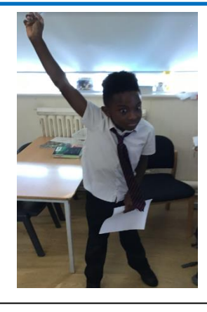
Year 3 loved recreating a folktale through drama this week!