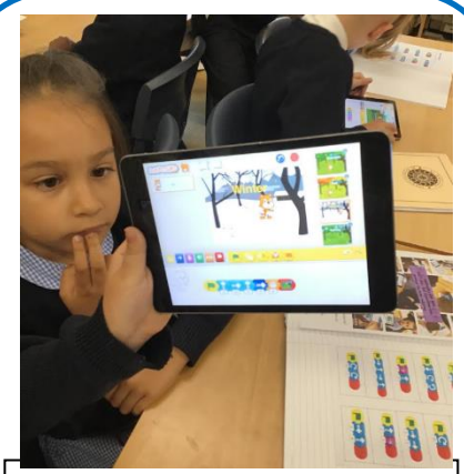
Year 2 loved making a sequence of commands in computing.