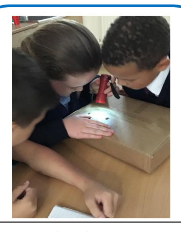
Year 3 loved investigating how light helps us to see!