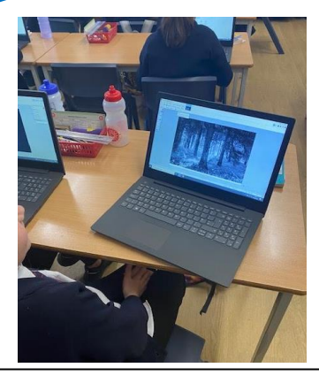
Year 4 loved experimenting with different colour effects in computing.