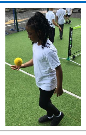
Year 3 loved practising their hand-eye coordination in PE this week!