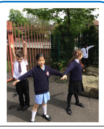
Year 2 loved describing properties of the wind and the Holy Spirit in RE.