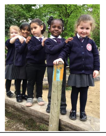
EYFS loved learning about the world behind them.

The children at St. Ambrose have had another wonderful week and we are proud of the children and their learning. You can see more pictures of their learning on our social media pages.