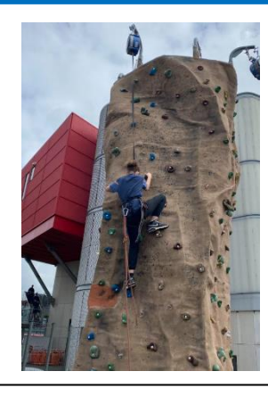
Year 5 loved visiting Lancashire County Cricket Club.