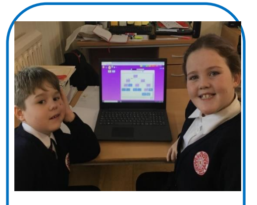
Year 3 have loved creating branching databases in Computing this week.