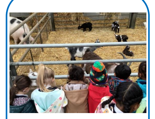
Early Years loved their trip to the farm on Wednesday.

It has been another wonderful week at St. Ambrose and we are proud of the children and their learning. You can see more pictures of their learning on our social media pages