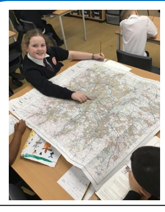
Year 3 loved using OS Maps to compare different areas of land use in Greater Manchester!