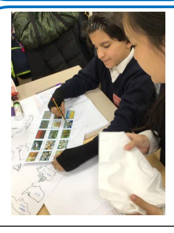
Year 6 loved learning about different types of trade in geography.