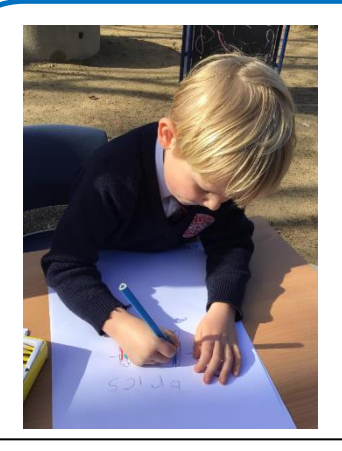
Early Years loved drawing outside this week.

It has been another wonderful week at St. Ambrose and we are proud of the children and their learning. You can see more pictures of their learning on our social media pages