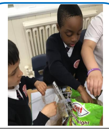
Year 2 loved planting seeds in science.