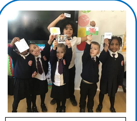
Year 1 loved playing 'Happy Families' for the four countries of the UK.