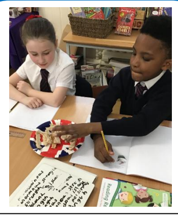
Year 3 have loved researching and tasting different types of bread in DT this week!