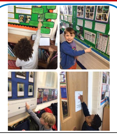
Early Years loved going on a number hunt around school.

It has been another wonderful week at St. Ambrose and we are proud of the children and their learning. You can see more pictures of their learning on our social media pages