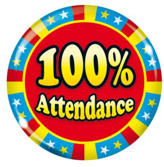
Well done to the 109 children who had 100% attendance in February.