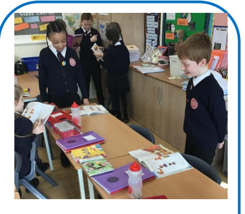
Year 4 loved acting out the play The Fly and the Fool in English.