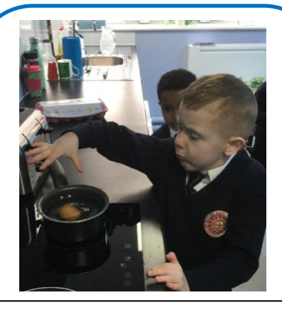
Year 1 have loved learning how to boil an egg