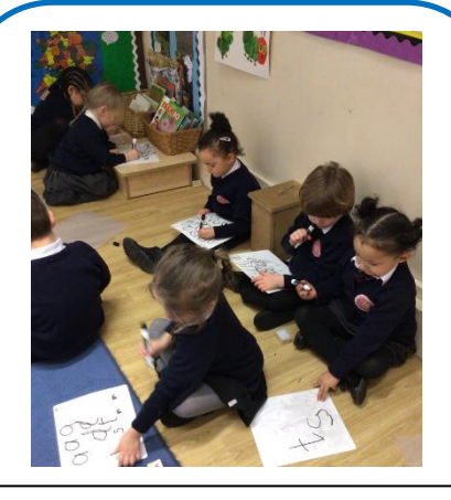
Early Years loved practicing their letter formation.

This week, we celebrated World Book Day with a range of activites to engage the children in reading. It was great to see so many children and staff arrive in school, in their pyjamas, and bring their favourite books with them.