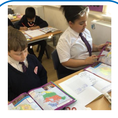
Y6 loved exploring the geography of North America's climate zones and biomes