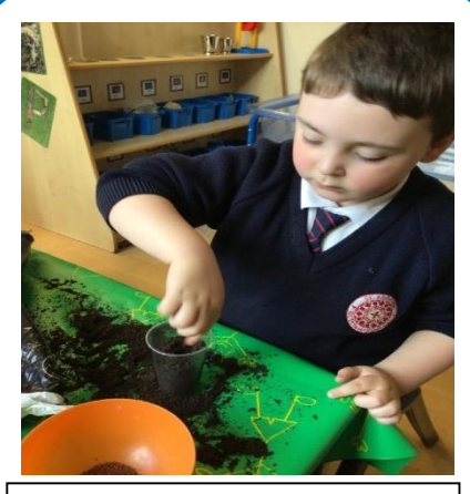
Reception have been planting cress this week as part of their growing topic.