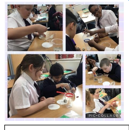
Year 5 had fun separating materials involving sieving and filtering in science this week.