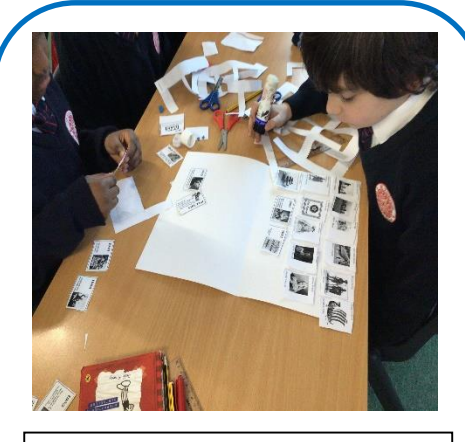
Year 3 loved learning about timelines and important things which happened in the last 100 years.