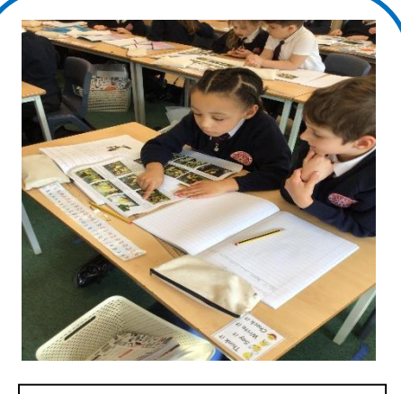
Year 2 children really enjoyed getting stuck into Where The Wild Things Are again in literacy!