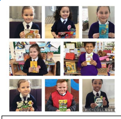
Well done to the children who won the Extreme reading competition on World Book Day. We hope you enjoy your prize.