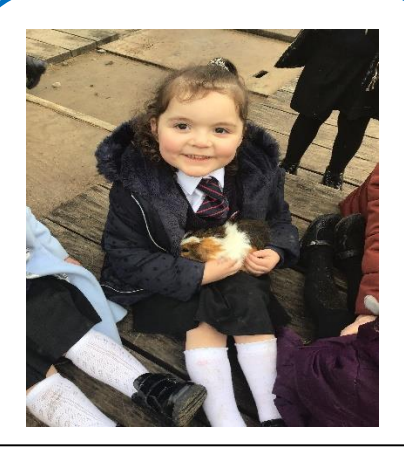
Nursery loved holding the guinea pigs and were very careful when stroking them.

The children and teachers are very proud of the learning that has been happening within school this week. To see more pictures, visit our Facebook, Twitter and Instagram pages.