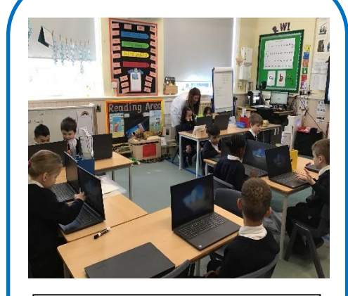
Year one have been practising logging into the laptops safely and learning about their right to privacy.