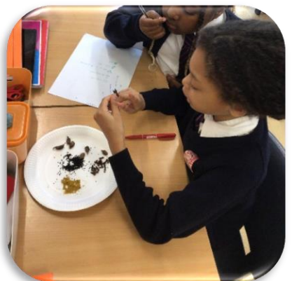
Year 5 loved learning about different spices and gloves in DT