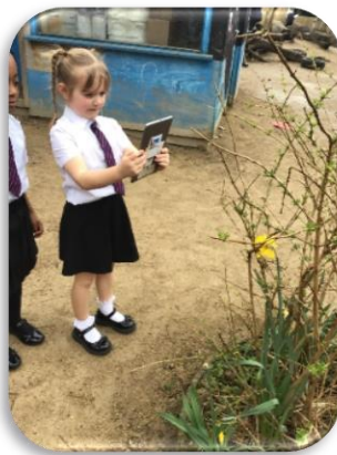
Year 1 have loved taking pictures of plants in our school grounds in Science