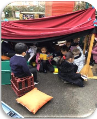
EYFS have loved making an outdoor reading tent

Spring 2 Week 3 of a great week at St. Ambrose and we are very proud of the learning that our children do.