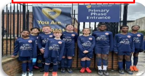
The school football team played a league match against William Hulme Grammar School and won their game on Wednesday evening.