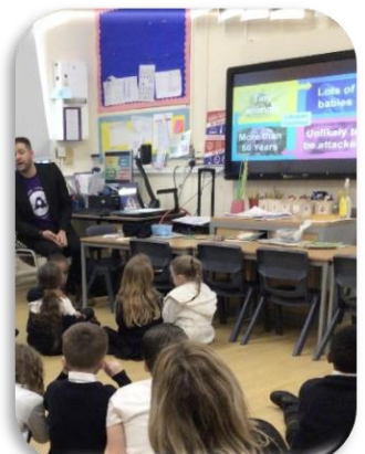
Year 2 have loved using their knowledge to learn about the life span of animals