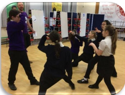
Year 6 loved learning all things science in their workshop