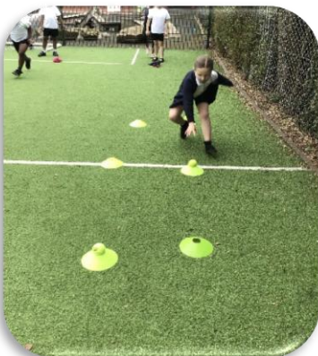
Year 3 have loved practising being ambidextrous in PE this week!