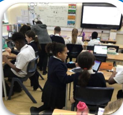
Year 6 have had another great computing lesson, exploring working online together on Scratch.