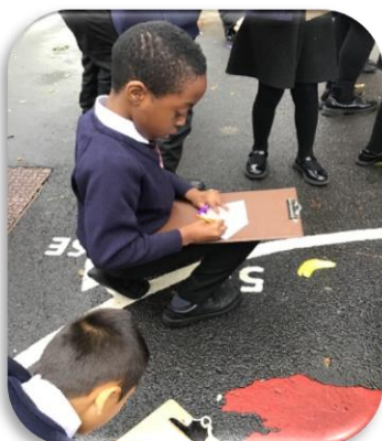
Year 3 have loved making compasses and exploring different directions in Geography.