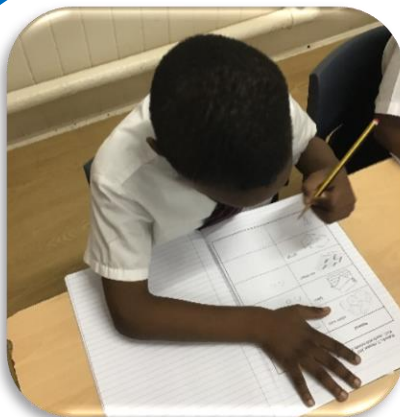
Year 1 loved testing which materials were absorbent in Science