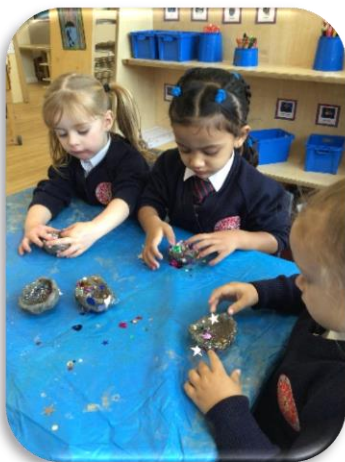
EYFS loved using clay to make Diwali lamps

Autumn 2 Week 2 of a great week at St. Ambrose and we are very proud of the learning that our children do.