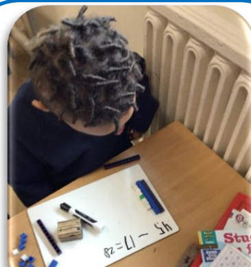
Year 2 have enjoyed using base 10 to help them solve addition and subtraction calculations crossing a multiple of ten.