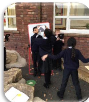
Year 5 loved learning about different filming techniques in computing.