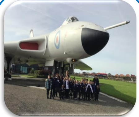
Year 2 had a great time learning about the development of flight at AVRÒ Heritage Museum.