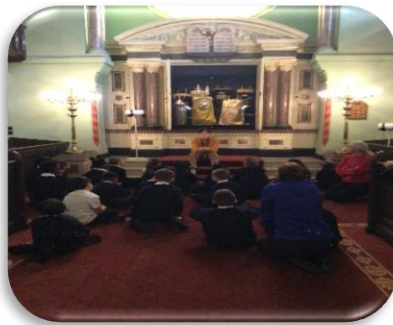
Year 4 had a wonderful time today at the Manchester Jewish Museum. They learned about different Jewish people and their stories, why Jewish people go to a synagogue and the different Jewish communities in Manchester.