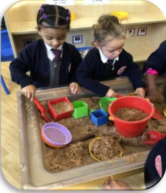
Early Years have loved discovering the properties of sand

Week 7 of a great week at St. Ambrose and we are very proud of the learning that our children do.