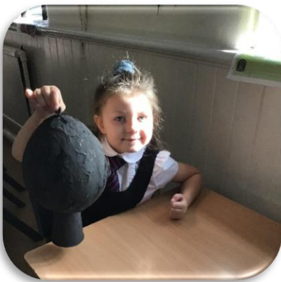
Year 3 have loved painting their papier mache Greek vases in traditional black this week!