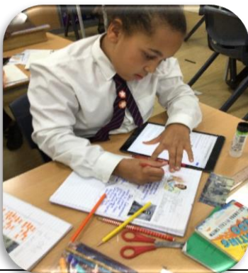
Year 6 loved learning about the forgotten science hero and Charles Darwin taxidermist teacher and mentor- John Edmonstone!