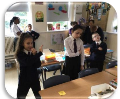
Year 5 loved using drama in English to show the status of characters.