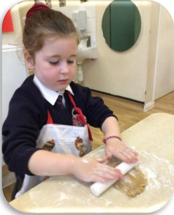
Early Years have enjoyed making gingerbread man biscuits

Week 3 of a great week at St. Ambrose and we are very proud of the learning that our children do.