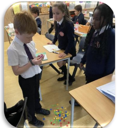
Year 5 loved going on a search for place value counters to help with their maths.