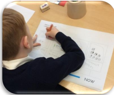
Year 1 loved making their own timelines in history.