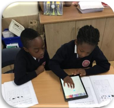
Year 3 have loved learning about how digital devices can help us in our lives in Computing this week!