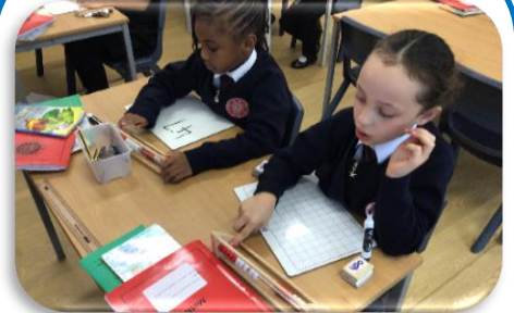
Year 2 loved using the rekenreks to help them with their counting.