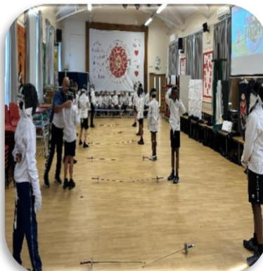
The first of 5 sessions of Year 6 fencing sessions.