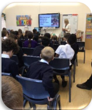
Year 5 and Year 6 with the Head teacher from Loreto High school