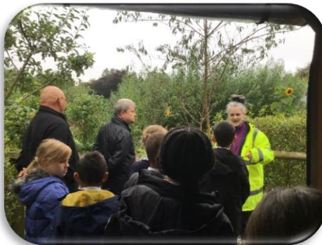
Our Caritas Ambassadors and School Council had a fabulous visit to Wardley Hall.