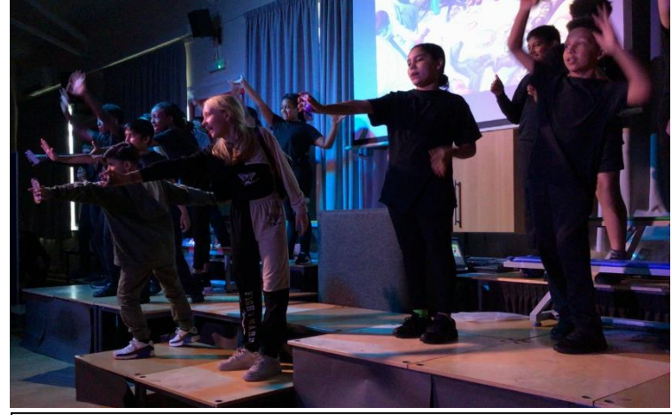
Goodbyes are not forever, goodbyes are not the end. They simply mean I miss you, until we meet again!