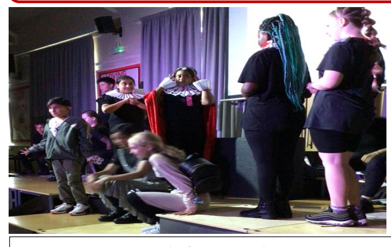
Year 6 'end of year' production