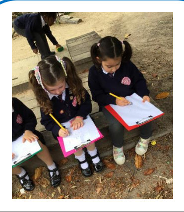
EYFS loved writing outdoors this week.

This week has been another wonderful week of learning at St. Ambrose and we are very proud of the children.