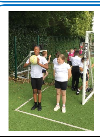
Year 4 practising skills for the pentathlon in PE.