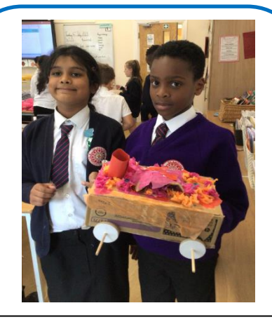
Year 5 loved creating their toy cars in DT.