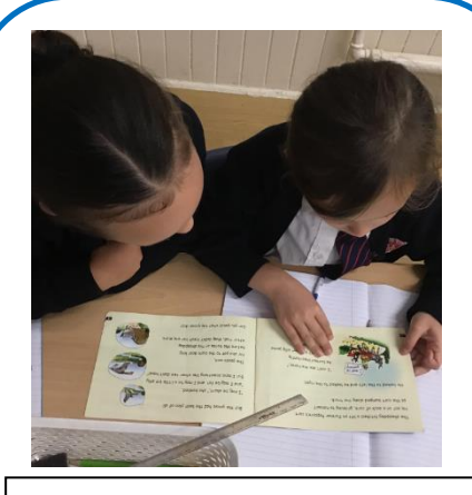
Year 1 have loved reading longer stories in RWI.