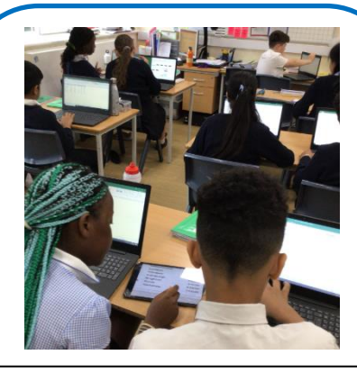
Year 6 have loved learning how to use excel spreadsheets to calculate data information.