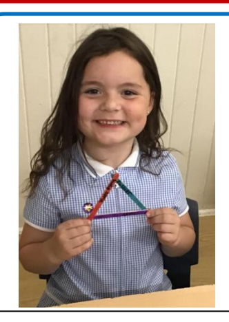
Year 1 loved learning about the Holy Trinity.