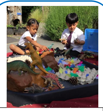
Early Years loved developing their understanding of the world through play.

It has been another wonderful week at St. Ambrose and we are very proud of the learning that our children do.