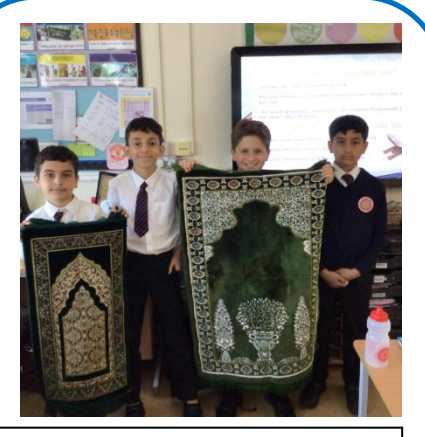
Year 4 loved learning about Islam and the Qu'ran from their brilliant classmates